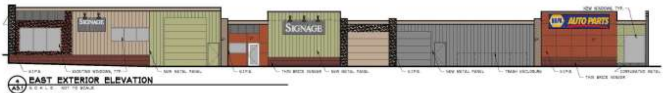
East Exterior Renovation

The information contained herein has been provided by the property owner or obtained from sources deemed reliable. Although the information is believed to be accurate, it is not guaranteed. The property is subject to price change, prior sale or lease and withdrawal from the market, without notice. Buyer is responsible to conduct its own due diligence, as this offering contains no representations or warranties.